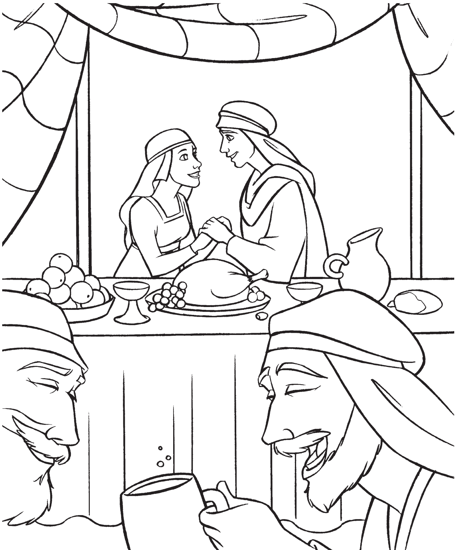
There was a marriage at Cana in Galilee, and the mother of Jesus was there; Jesus also was invited to the marriage, with His disciples. (John 2:1-2)