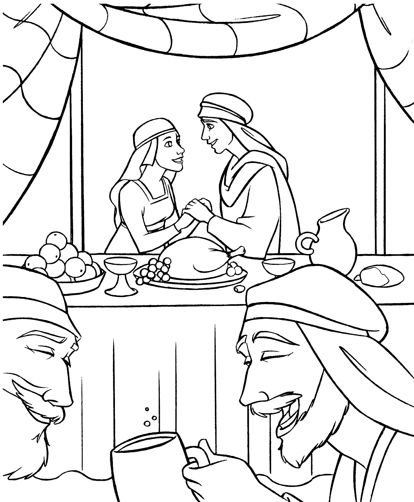
There was a marriage at Cana in Galilee, and the mother of Jesus was there; Jesus also was invited to the marriage, with His disciples. (John 2:1-2)